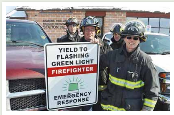
FLASHING GREEN LIGHT – Across the province, the flashing green light is used by volunteer firefighters on their way to an emergency.

This year marks the 20th anniversary of the passage of an amendment to the Highway Traffic Act, allowing volunteer firefighters to use a flashing green light on their vehicles when responding to an emergency.