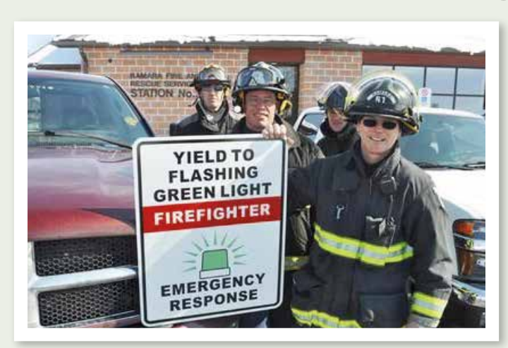
FLASHING GREEN LIGHT – Across the province, the flashing green light is used by volunteer firefighters on their way to an emergency.

This year marks the 20th anniversary of the passage of an amendment to the Highway Traffic Act, allowing volunteer firefighters to use a flashing green light on their vehicles when responding to an emergency.