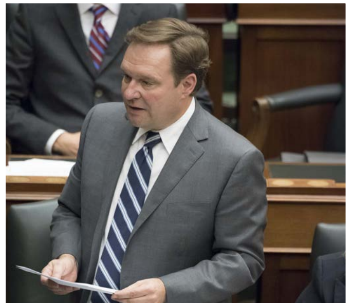
EXPANDING ONTARIO'S TREE PLANTING EFFORTS – Ted Arnott speaks in the Ontario Legislature after the Government announced the establishment of Ontario's Green Leaf Challenge.