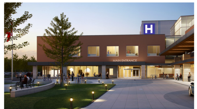
A NEW GROVES HOSPITAL – An architect’s depiction of the new Groves Memorial Community Hospital in Centre Wellington. The new hospital is expected to be open and serving the community in the fall of 2019.

The new hospital is expected to be completed in late 2019.