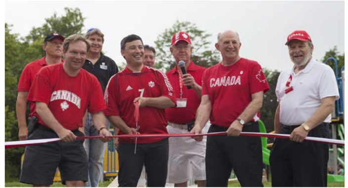
VICTORIA PARK IN HILLSBURGH – The Town of Erin celebrated the grand opening of Victoria Park in Hillsburgh on July 1, Canada Day. The park includes a fully accessible playground.