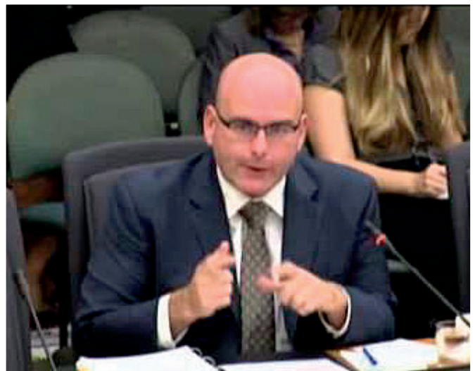
MINISTER OF TRANSPORTATION – Transportation Minister Steven Del Duca attended the Estimates Committee hearings in October. Mr. Arnott is continuing to push the Minister to put the Highway 6 Morrison bypass onto his Ministry's 5 year plan for highway construction.

"Intersected by Highway 6, the village of Morrison" in the township of Puslinch "has become a bottleneck at the centre of a main transportation and trade corridor. The two-lane stretch of road on an otherwise four-lane highway is impeding the movement of people and goods between Wellington county, the GTHA and the US.