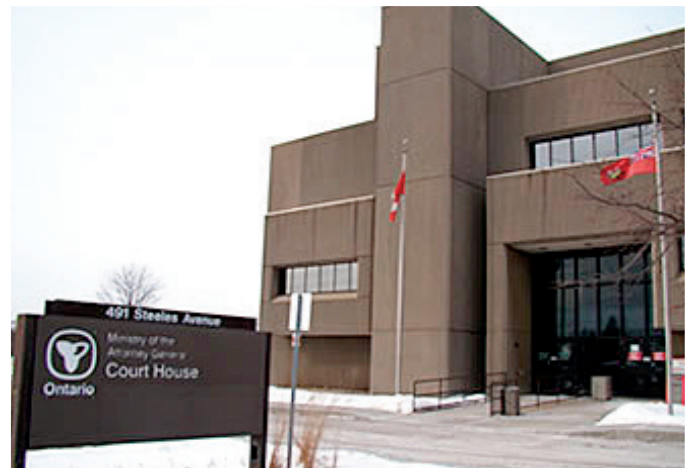
HALTON COURTHOUSE – The Milton Courthouse on Steeles Avenue needs to be replaced. The current courthouse is aging, overcrowded, and inadequate.