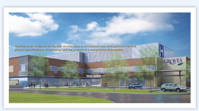
A NEW GROVES HOSPITAL – An architect's depiction of what the new Groves Memorial Community Hospital may look like.

Three bids have been submitted to Infrastructure Ontario to design, build, and finance the new Groves Memorial Community Hospital in the Township of Centre Wellington.