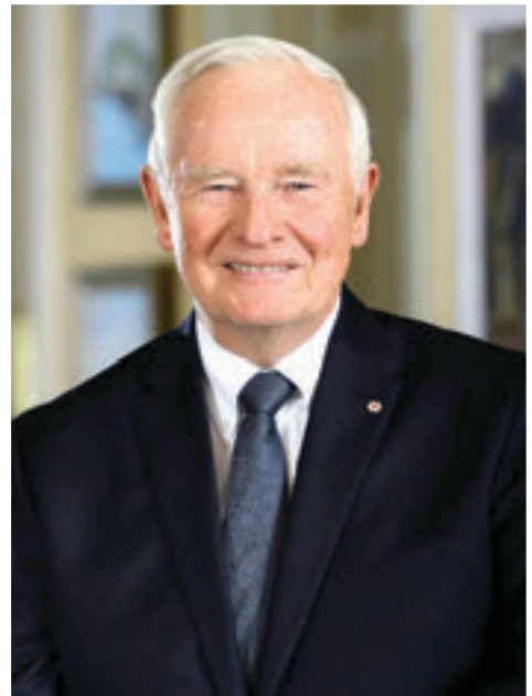
THE RIGHT HONOURABLE DAVID JOHNSTON – As Governor General of Canada from 2010 to 2017, David Johnston "called upon all Canadians to join in the building of a smarter, more caring nation. His seven-year viceregal mandate—the third longest in Canadian history— was characterized by inclusiveness, dedication, energy and ambition in quest of a smarter, more caring Canada and a better world."

On behalf of (our) Caucus, we offer our thanks, and wish them good health and much happiness in the years to come.