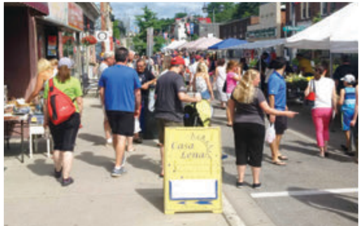
GEORGETOWN FARMERS' MARKET – Downtown Georgetown always attracts a large crowd on Saturday mornings from June to October for its Farmers' Market, hosted by the Georgetown BIA. Many communities in Wellington-Halton Hills have outstanding farmers' markets.