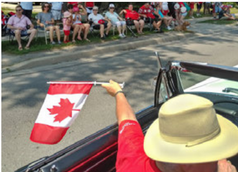
HAPPY CANADA DAY! – Crowds enjoyed seeing all of the classic cars and patriotic floats at the annual Canada Day parade in Glen Williams.