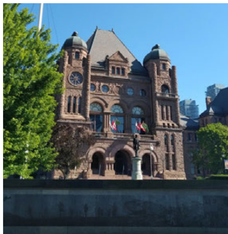
REMEMBERING THEIR SACRIFICES – The Ontario Veterans' Memorial stands in front of the Legislative Assembly of Ontario and depicts scenes of Canada's military history, including those at Juno Beach on D-Day, 75 years ago this year.

Ontario Electoral Districts - 2015 Representation Act Circonscriptions électorales de l'Ontario - Loi de 2015 sur la représentation électorale