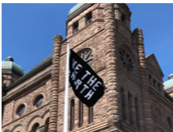
NBA CHAMPIONS – A "We The North" flag flies at the Legislature on June 14th following the Toronto Raptors' incredible playoff run and championship win against the Golden State Warriors.