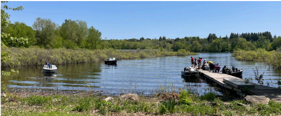
Gone Fishing — Over 550 anglers registered for the Belwood Lions Club’s annual Pike and Walleye Derby. There are many great lakes and rivers around Wellington-Halton Hills for fishing, swimming, boating, and relaxing. Don’t forget your lifejackets to stay safe while you have fun!

Head for the Hills is a day of craft beverage sampling, gourmet food, and live music in the beautiful countryside. Voted the #1 Beverage Festival in Ontario, Head for the Hills is a guaranteed good time rain or shine.