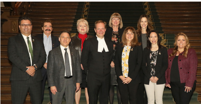
Provincial Neighbours — The Legislative Assembly of Ontario and the Assemblée nationale du Québec come together through the Ontario Quebec Parliamentary Association to share ideas, compare policies, and further the friendship between Parliaments. We were honoured to host the Quebec delegation in Toronto this year.